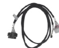
23-Pin/ 35-Pin Wire Harness