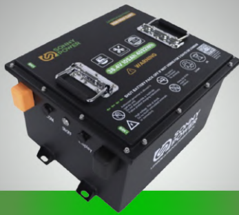
36V 105AH LiFePO4 (SP-36V105-GC)