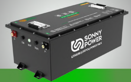
48V 135AH LiFePO4 (SP-48V135-GC)