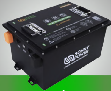
48V 105AH LiFePO4 (SP-48V105-GC)