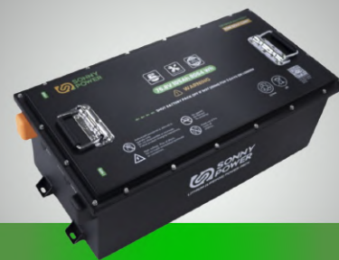
72V 105AH LiFePO4 (SP-72V105-GC)