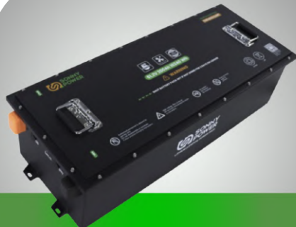
48V 200AH LiFePO4 (SP-48V200-GC)